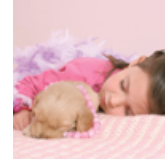
Soften Their World Baby Throw (crochet)