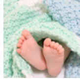
Soften His World Baby Throw (knit)