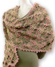
Lace Lattice Wrap