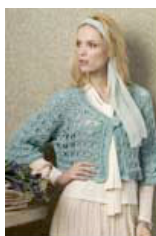
Barcelona crocheted in Country designed by Washi Braha

Country is a wonderful blend of microdenier (or "ultrafine") acrylic and merino wool. So many designers, knitters and crocheters are telling us that the twist and cabled construction of this yarn is allowing them to create textural stitches that give every project something special. Cables, lacework, bobbles and more all look great in Country . With 24 harmonizing colors in a graduated color palette, Country may become your favorite yarn for all your projects.