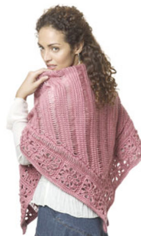
click to enlarge image